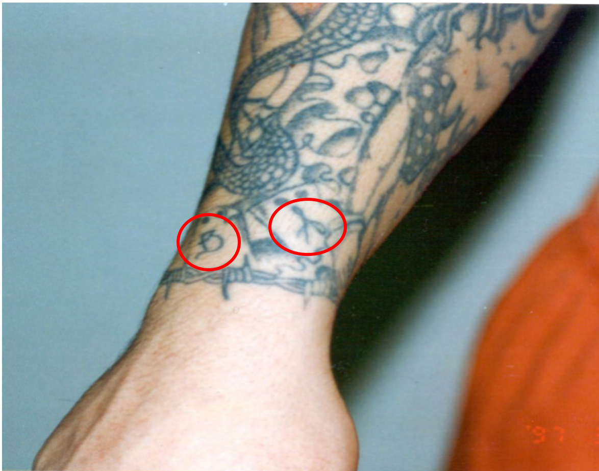
Graphic within tattoo may reference Barrio Azteca, 21, Azteca Indian Headdress, etc., or may just contain the word Azteca.